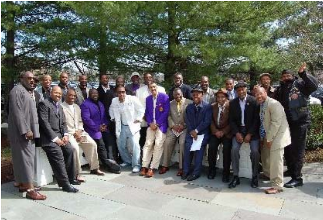
Chi Upsilon Brothers pose for a group photo after the Jazz Brunch