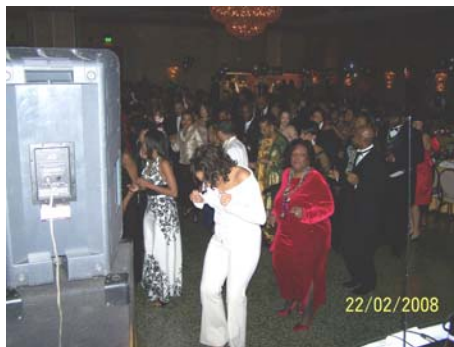
Brothers and Guest enjoying a dance at the 2008 Iota Nu Mardi Gras