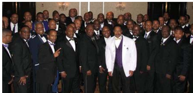
Lambda Gamma Gamma Brothers at the Achievement Week Celebration