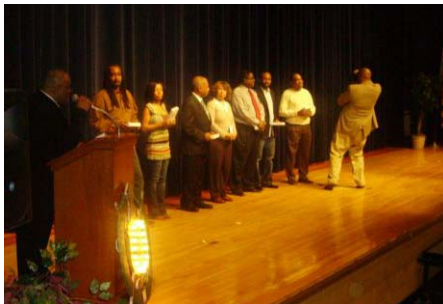
Gamma Pi Talent Hunt Contestants

Prince George's County, Md. - So much of the news about our youth is negative and depressing. From crime and violence to the phenomenon of "babies having babies," the headlines are filled with stories of young people who are experiencing dwindling opportunities before they can even reach their 21 st birthday. But Gamma Pi chapter recently showcased some of the best and brightest talent in its home territory of Prince George's County, thanks to the successful 36 th Annual Omega Talent Hunt program held March 8 at Charles Herbert Flowers High School in Springfield, Md.